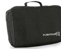
Single Headset Bag 540-0622-10